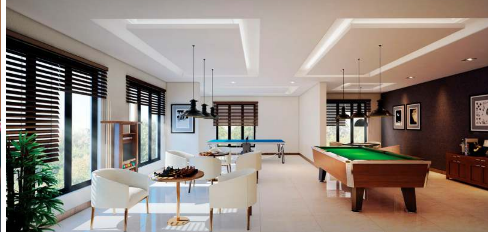
TABLE TENNIS MULTIPURPOSE HALL LIBRARY GYMNASIUM GAME ZONE

your very own recreation zone — CLUBHOUSE FEATURES —